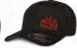
FLEXFIT® W/RED DOME LOGO • Embroidered logo • Extended sizes X0128 $39.99 S-M, L-XL, 2X