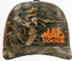
CAMO HAT • Snapback closure • Extended sizes Y0125 $47.99