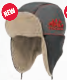
NEW TRAPPER HAT • Sherpa lined • Embroidered logo Y0101 $54.99