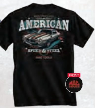
90'S TEE • 80% Cotton/20% Polyester • Vintage wash Y0134 M, L, XL, 2X, 3X $47.99 4X, 5X $54.99