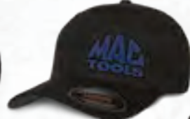
FLEXFIT® BLUE LOGO HAT • Embroidered logo • Extended sizes W0036 $38.99 S-M, L-XL, 2X