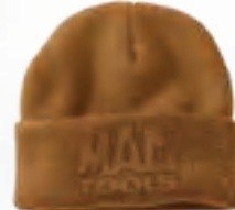
CAMEL EMBOSSED LOGO BEANIE • 100% Acrylic Y0071 $33.99