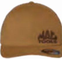
CAMEL LOGO TRUCKER HAT • Snapback closure • Embroidered design X0084 $40.99