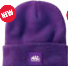
NEW FOLDOVER BEANIE • 100% Acrylic Y0070 $33.99