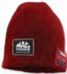
BLUETOOTH® BEANIE • Built in microphone for hands-free talking • Washable with headphone component removed • Charging cable included Y0090 $47.99