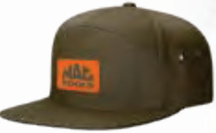
RICHARDSON® LEATHER STRAPBACK HAT • Brass eyelets • Adjustable leather backstrap • Embroidered patch Y0152 $47.99