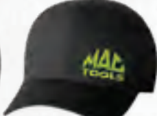
HI-VIS FLEXFIT® LOGO HAT • Embroidered logo • Extended sizes N6002 $40.99 S-M, L-XL, 2X