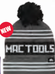
NEW INTARSIA BEANIE • 100% Acrylic Y0069 $33.99