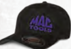
BLACK FLEXFIT® HAT W/PURPLE DOME LOGO • Large embroidered logo • Extended sizes V0017 $44.99 S-M, L-XL, 2X