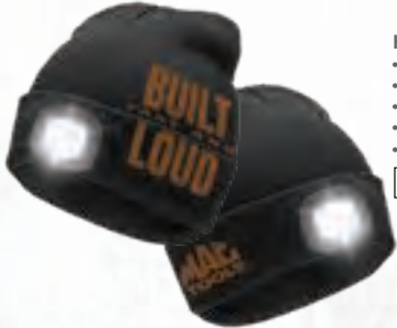
HEADLIGHT BEANIE • Rechargeable headlight • 48 Lumens headlight • USB charging cord • 2 hours charging time • 8 hour battery life X0059 $39.99