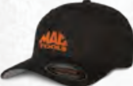
BLACK FLEXFIT® HAT W/ORANGE DOME LOGO • Embroidered logo • Extended sizes Y0123 $40.99 S-M, L-XL, 2X