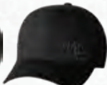
FLEXFIT® BLACK LOGO HAT • Embroidered logo • Extended sizes X0083 $40.99 S-M, L-XL, 2X