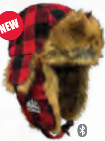
NEW BLUETOOTH® TRAPPER HAT • Built in microphone for hands-free talking • Includes USB charging cord Y0106 $67.99