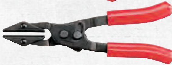
AUTOMATIC HOSE PINCH-OFF PLIERS - 9-1/4"