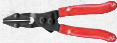
MINI HOSE PINCH-OFF PLIERS - 5-1/4"