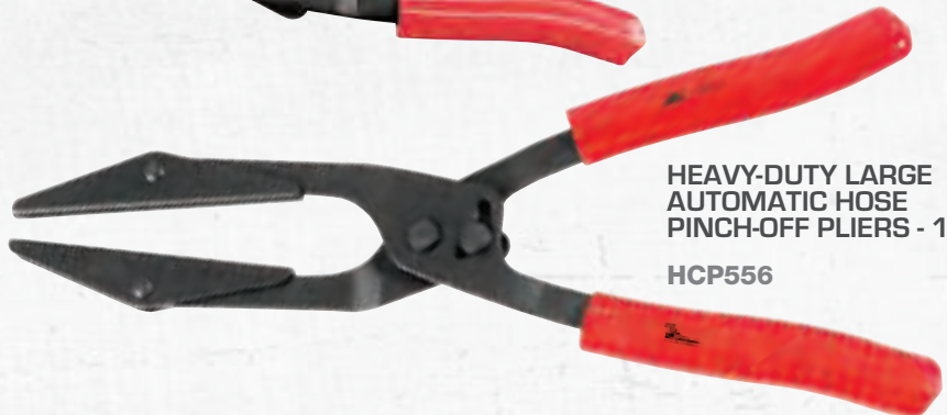
HEAVY-DUTY LARGE AUTOMATIC HOSE PINCH-OFF PLIERS - 14"